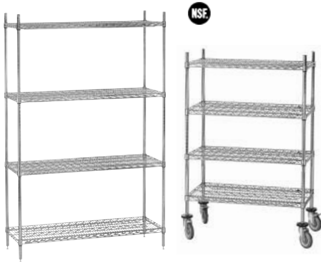
with Optional Casters